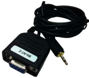
Junior Egg Interface Product Code: MN-INT-E

Connects the Junior Egg Logger to a PC or chart reader via serial port