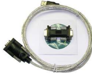
USB to Serial Port Adapter Product Code: EA-USB-SER

Connects the Junior Egg Logger to a PC or chart reader via serial port