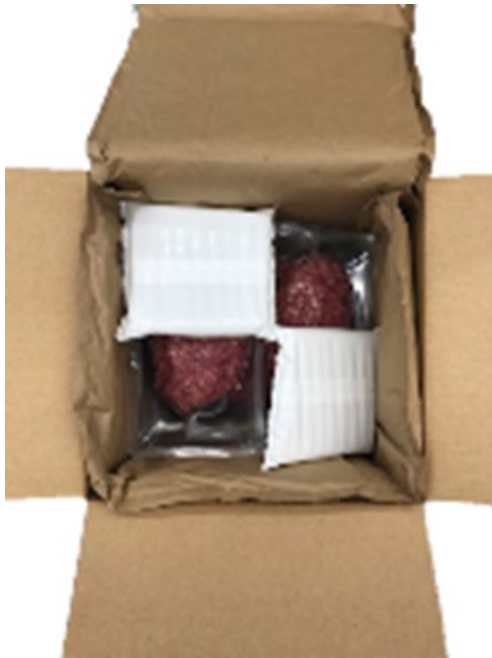
Trial Tempguard insulator Profil: ambient temperature Config: : 4 Gels packs 1kg at -25°C